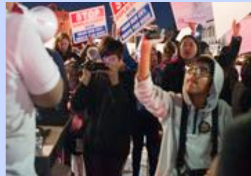
NV4Y Students film the march against displacement organized by Siena Youth Center’s student-led advocacy group.

Their first videos are profiles of themselves, focusing on what makes their home special. At Siena Youth Center, New Voices has coordinated with Siena’s student-led Advocacy group, culminating in filming their march against displacement. Their final videos combined their profiles and video from the march. These videos were screened on December 21 and were very well received. They will be posted to our NV web site on the Video Gallery page — http://www.newvoicesforyouth.org/video-gallery/ .