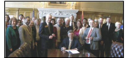
March 2009. Lobbying Success For Arkansas LWV. Governor Signs Conservation Bill

approximately six months before the Nineteenth Amendment of the United States Constitution gave women the right to vote. It began as a "mighty political experiment" aimed to help newly-enfranchised women exercise their responsibilities as voters. *