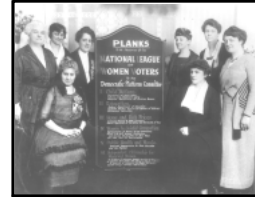
Planks of the National League of the Women Voters

The League of Women Voters is an U.S. political organization founded