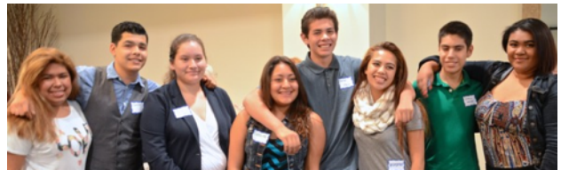
NV4Y and YLAC teens at the Summer Social